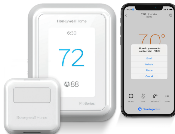
T10+ Smart Thermostat with RedLINK® 3.0