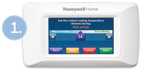
Set the peak pricing temperatures.

Use the Time-of-Use pricing schedule provided by your utility to create a utility schedule on Prestige by answering a few simple questions such as "Which temperatures would you like to adjust based on your Utility Schedule?" and "What is the maximum or minimum temperature you want during a high-peak pricing period?"