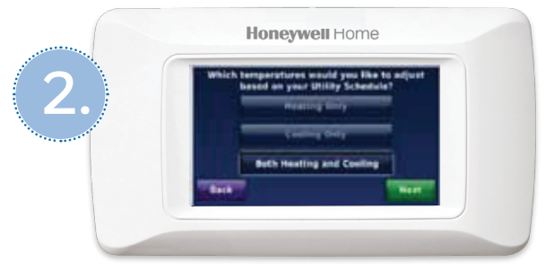
Select which seasons have a utility schedule.