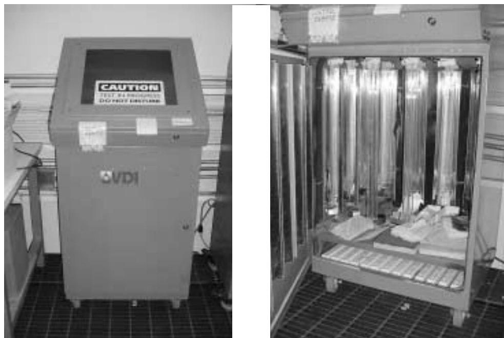
Figure 1 – Ultraviolet Exposure Test Chamber

Testing was conducted in a chamber designed specifically for evaluating the effect of UVC exposure on various materials. Twelve 55-watt UVC lamps power the interior of the test chamber, shown below in Figure 1. The high UVC output of the lamps, the reflectivity