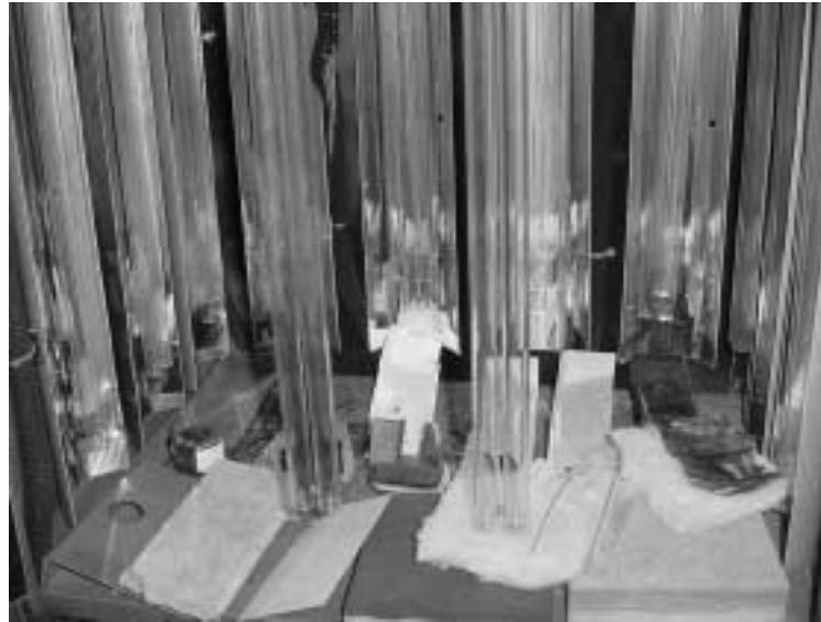
Figure 2 – Materials Under Test in Chamber

board, wood studs, and wire insulation. Figure 2 shows a sampling of the materials under test. Detailed test results are shown in Appendix D.